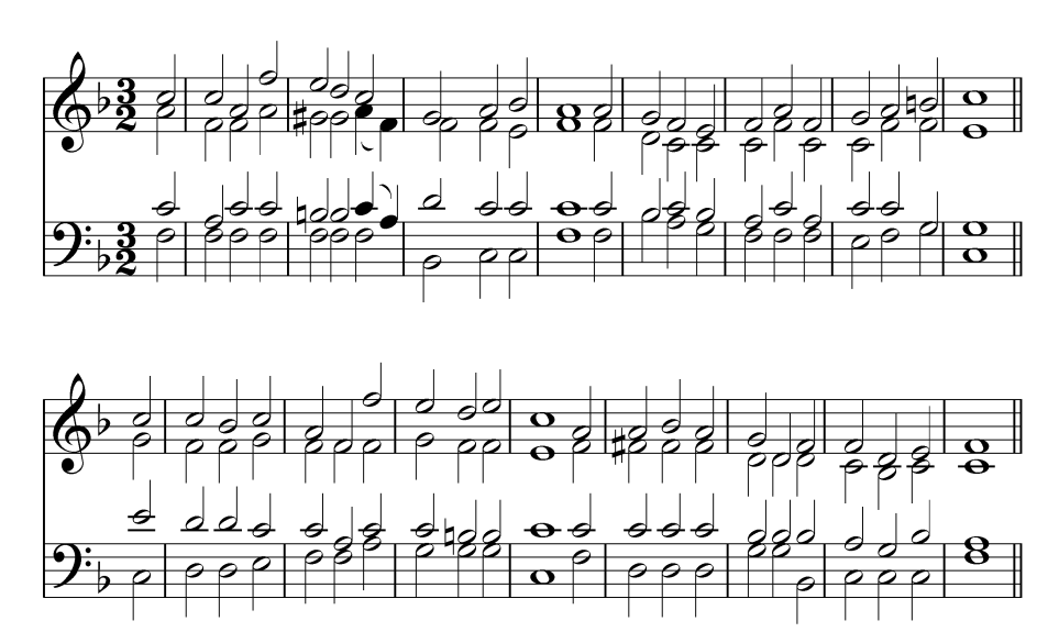
Hymn 11 in "Gadsby's Hymns" Tune 835 in "The Companion Tune Book"