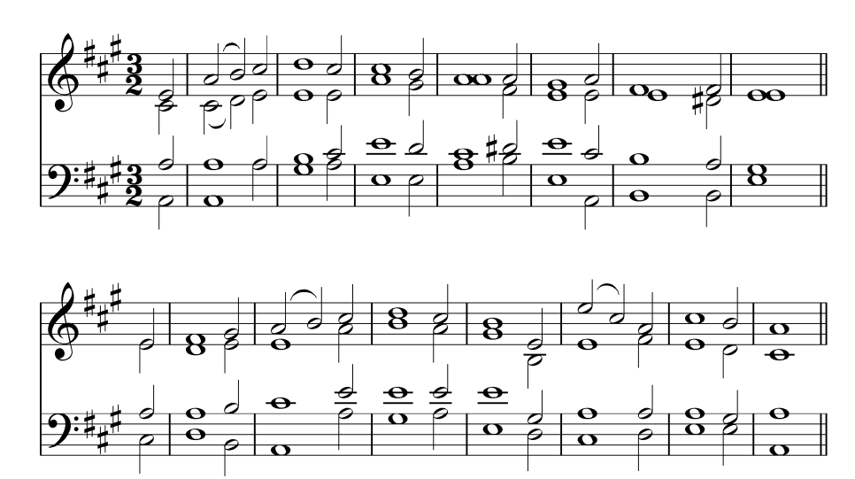
Hymn 14 in "Gadsby's Hymns" Tune 141 in "The Companion Tune Book"