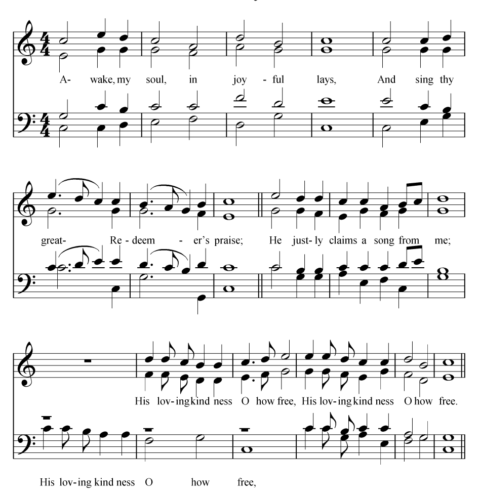
Hymn 9 in "Gadsby's Hymns" Tune 324 in "The Companion Tune Book"