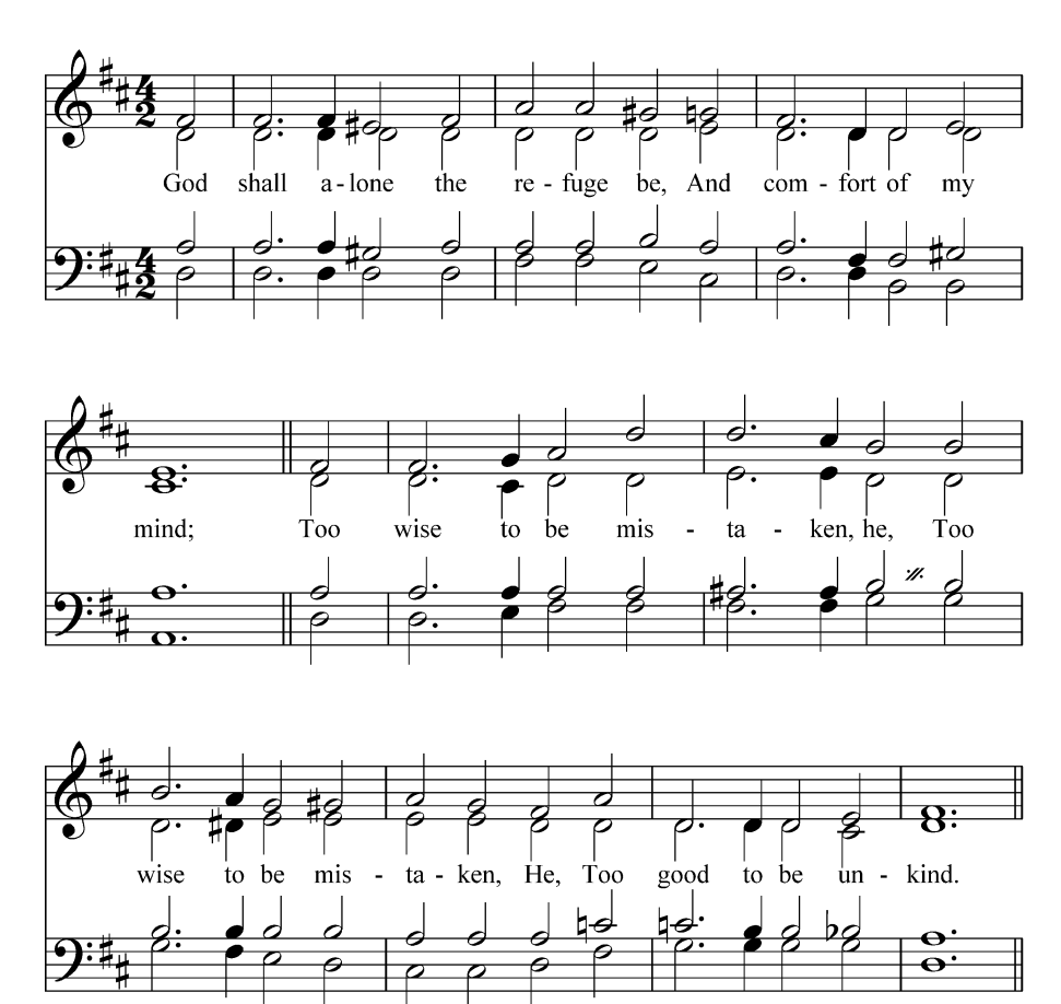
Hymn 7 in "Gadsby's Hymns" Tune 211 in "The Companion Tune Book"